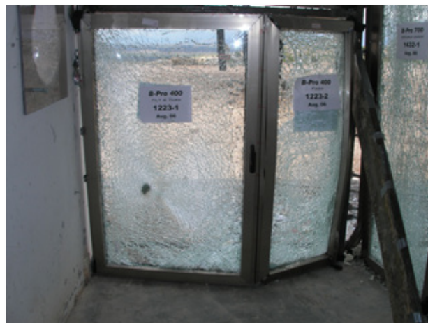
*EMRTC Blast Test