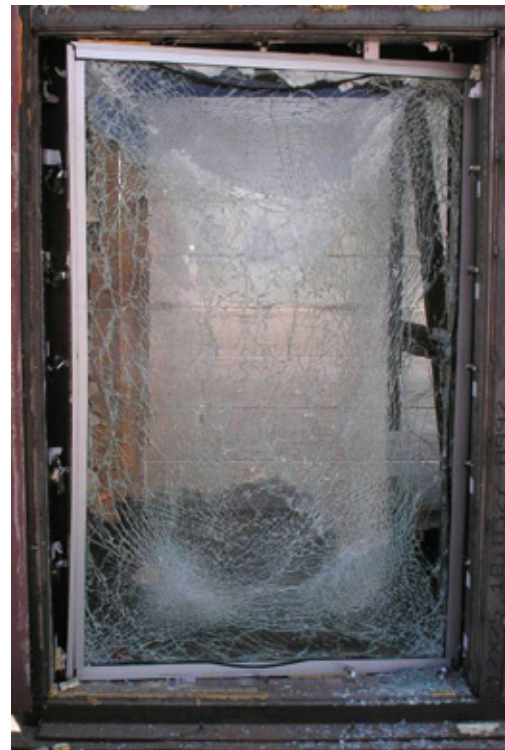
*HTL Blast Test